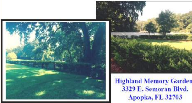
Highland Memory Gardens 3329 E. Semoran Blvd. Apopka, FL 32703